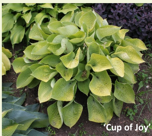
'Cup of Joy'

Questions? Give us a call or email! 919-309-0649