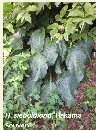
H. sieboldiana 'Hakama Souvenir'